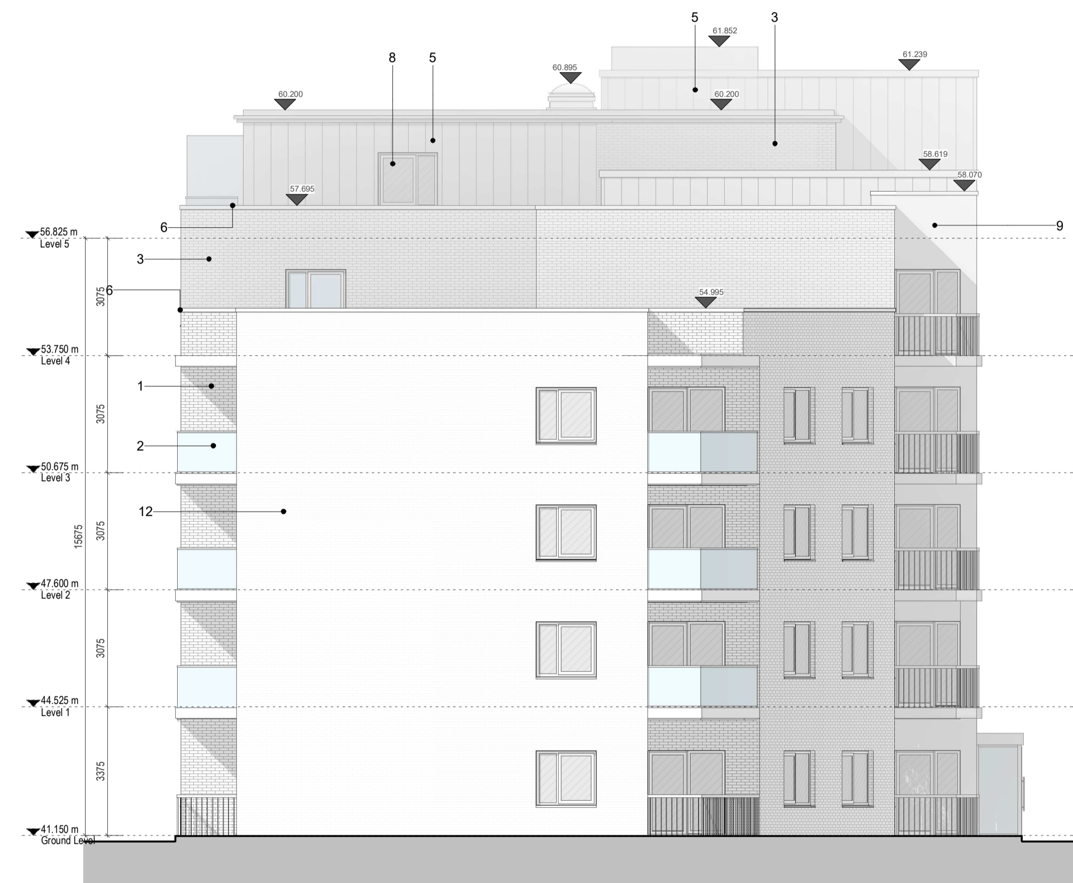
1 GA - East Elevation 1 : 100