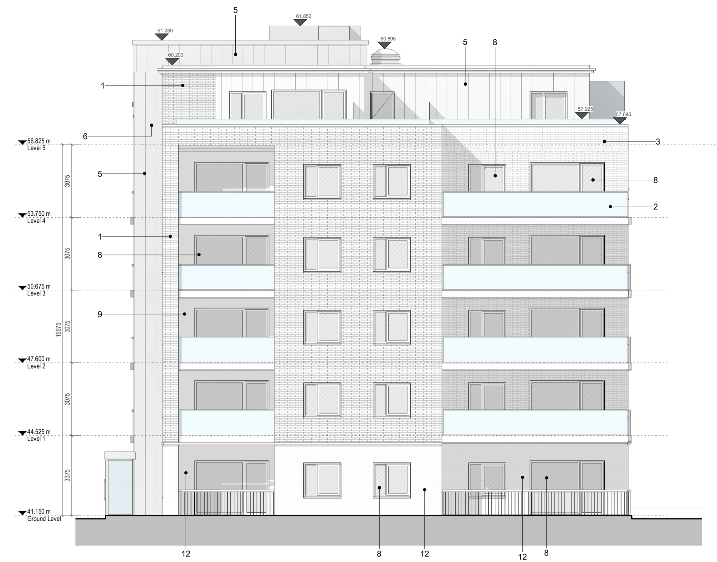
2 GA - West Elevation 1 : 100